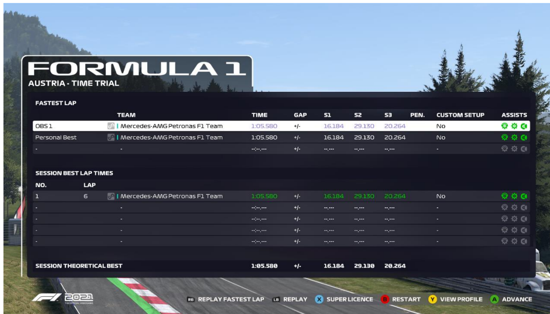
Example of screenshot taken from the end-of-session screen in the Game.